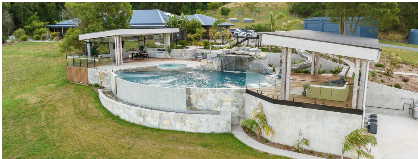
APEX POOLS AND SPAS

Choosing to become an MPB member is a pivotal step in enhancing a pool builder's profile both within the industry, and the broader community. Membership is a recognition of a builder's professionalism and commitment to the industry.